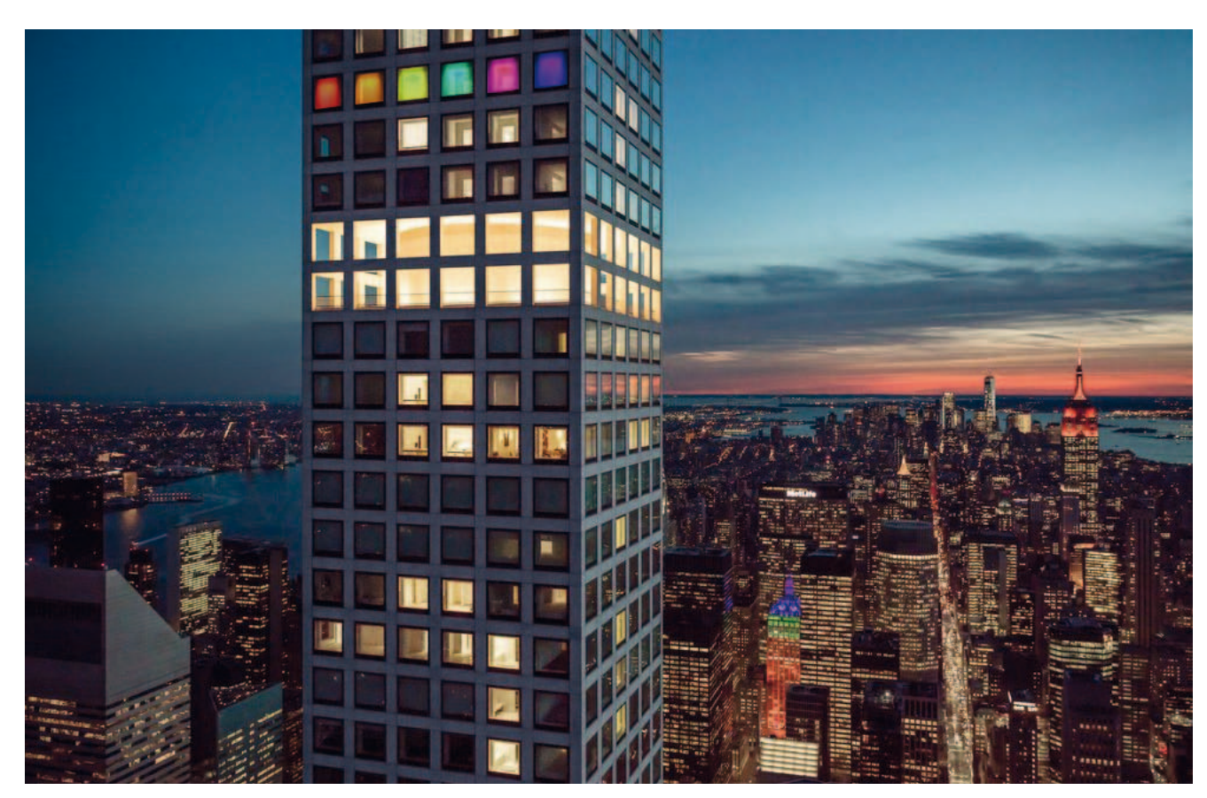
The skin of the building, designed by architect Rafael Viñoly, is treated with an LED lighting system that changes colors. The system can be controlled by the client with their iPhone from the street.